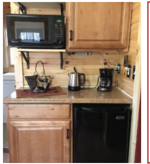
Make a cup of coffee or tea, or warm a snack in the microwave.