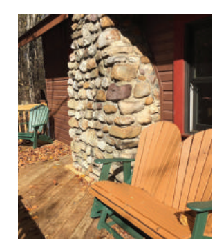
Read a book, soak in the sunshine and enjoy the wooded surroundings from the spacious deck with Adirondack chairs and double glider.