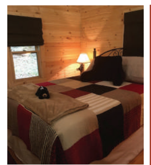
Rest on a comfortable Queen size bed with Tempurapedic mattress and beautiful views of the woods.