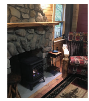
A gas stove warms the relaxing seating area around the stone chimney.