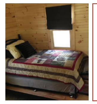
The second bedroom has a twin size trundle bed.