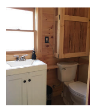
Your feet will appreciate the heated bathroom floor as you step out of the shower!