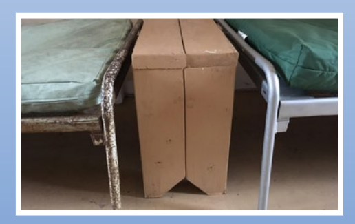
Cots for the cabins - before and after!